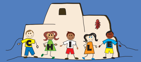
Child Health Initiative for Lifelong Eating & Exercise